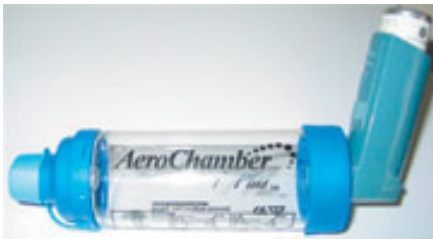
Metered Dose Inhaler with Spacer

Depending upon your individual needs, your doctor may order nebulizer treatments for your albuterol rather than metered dose inhalers. A nebulizer is an electric or battery-powered machine that turns liquid albuterol into a fine mist that you then breathe into your lungs. The nebulizer treatments usually take 5 to 10 minutes to deliver the medication.