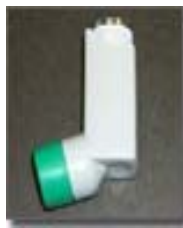
Metered Dose Inhaler